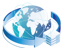
Millions of Customers Worldwide