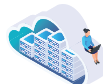
24/7/365 Tech Support

eFax, part of J2 Global ® , Inc., is a hosted Cloud Fax service used by millions of corporate customers worldwide — including thousands of UK companies and nearly half of the FTSE 100. The company's worldwide presence includes numerous offices in the U.S. and Canada as well as a European headquarters in Dublin, Ireland. A company with a nearly 20-year track record of significantly improving the fax infrastructure of organisations like yours, eFax: